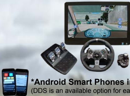
All-In-One Desktop Simulator with Distracted Driving System (DDS)